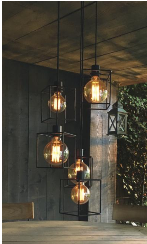
KERMA 5 o26 in brushed bronze with structures in black epoxy