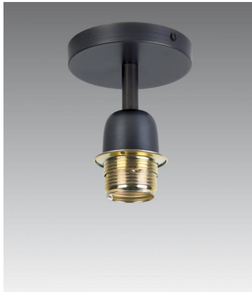
KENTIKA E27 in brushed bronze